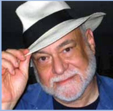
AMERICAN MUSEUM OF NATURAL HISTORY